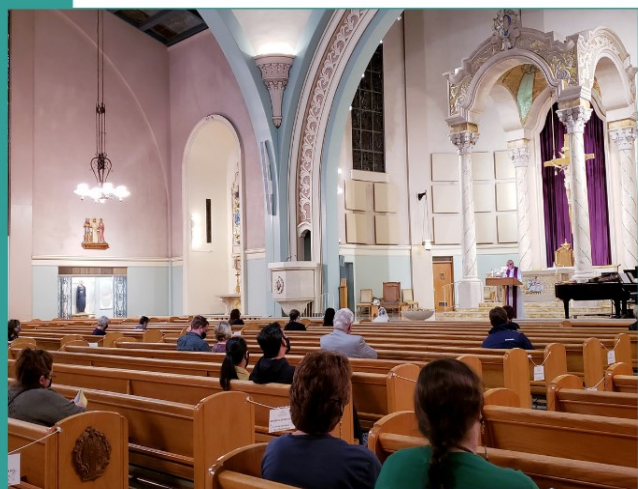
Novena of Grace - Lent 2020