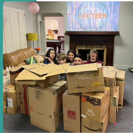
LifeTeen High School Youth Ministry