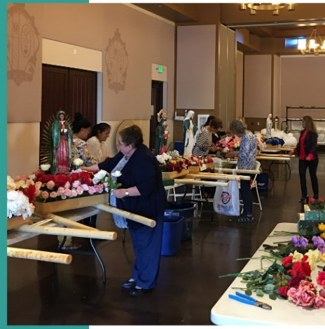
Preparing for Marian Procession